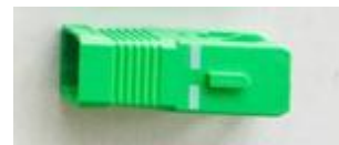
SC/APC Housing 绿壳