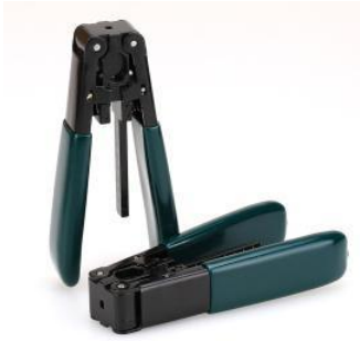
Model: LTS-242 FTTH Drop Cable Stripper