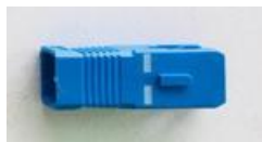
SC/UPC Housing 蓝壳