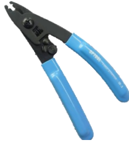
LTS-212/213 Fiber Stripper