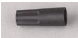
Connector Screw Cap 螺帽