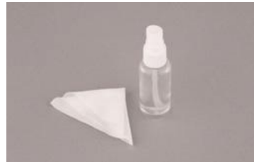
Dust-free cloth & alcohol bottle