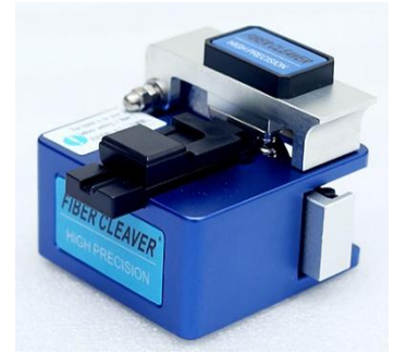
LFC-300 Fiber Cleaver