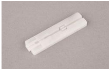
Fixed length device